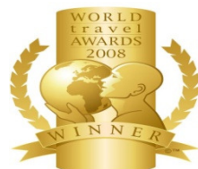
Germany's Leading Golf Resort

http://resort.a-rosa.de/english/scharmuetzelsee/resort/resort/